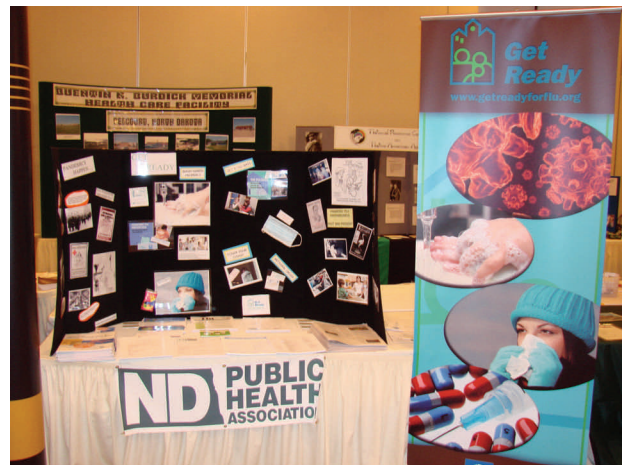
The display booth at the Dakota Conference on Rural and Public Health 2008.

The Get Ready for Flu display and banner are available for NDPHA members for use in promotions, exhibits, exercises, etc. Please contact the NDPHA office if you are interested in using these items.